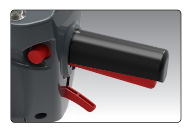
Colour-coded Touch Points Operator friendly colour-coded touch points.